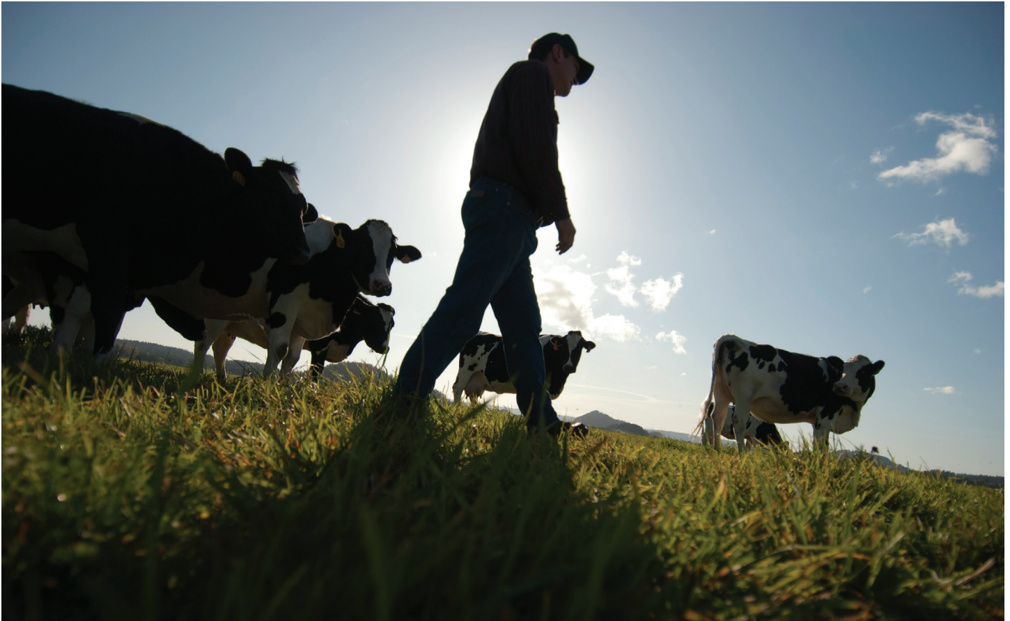
The Dairy Feed in Focus program is designed to help dairy farmers and the supply chain meet the growing demand for food while protecting our environment.

ECONOMIC & ENVIRONMENTAL BENEFITS FOR U.S. DAIRY FARMS OF ALL SIZES