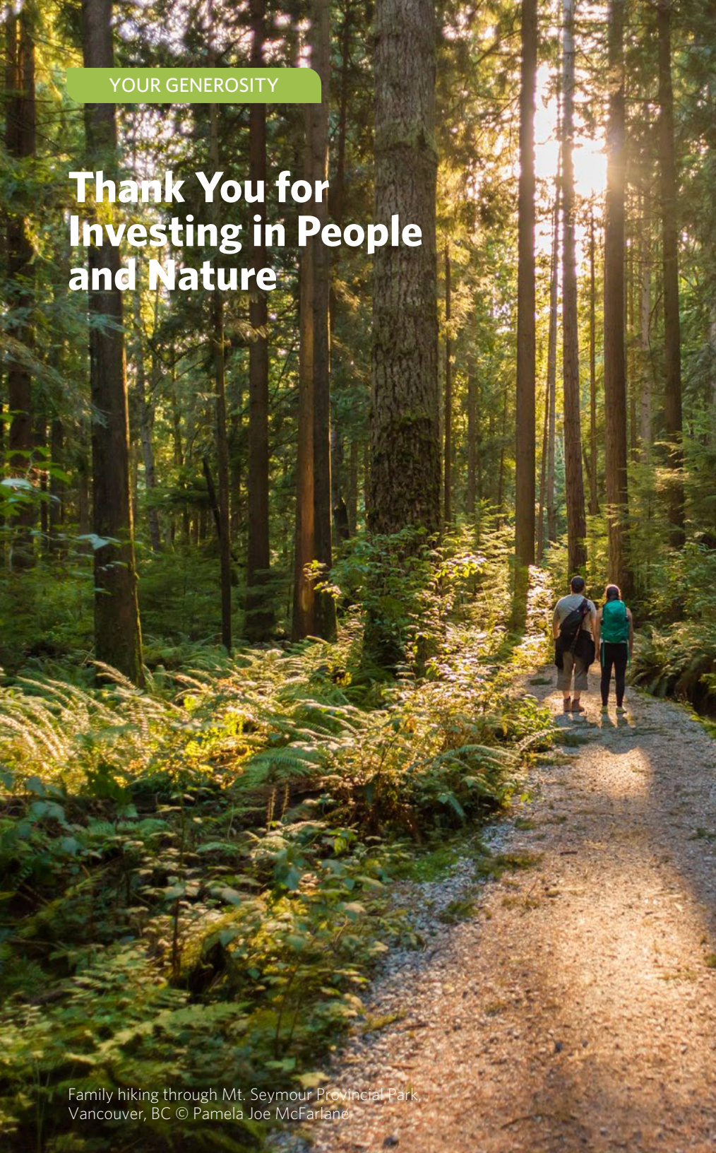
Family hiking through Mt. Seymour Provincial Park, Vancouver, BC

Your support has been instrumental to our growth and success. Because of you, we are accelerating climate action, working in partnership with Indigenous Peoples to advance their conservation visions, and protecting globally significant lands and waters. Our special thanks go to the supporters listed below who made outright gifts or pledges to the Nature Conservancy or Nature United to support our work in fiscal year 2022 (July 1, 2021-June 30, 2022).