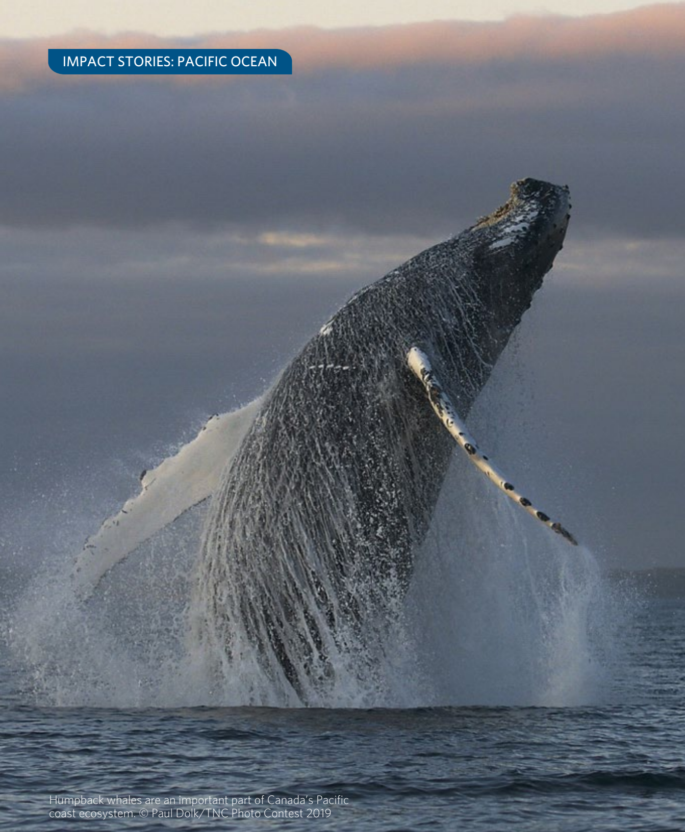
Humpback whales are an important part of Canada's Pacific coast ecosystem.

deal to finance the purchase of approximately 835,000 pounds of mixed fishing quota and licenses. This new investment will help build community-driven fisheries that create new jobs and build local harvest capacity. It will also catalyze new funds for strengthening local fisheries operations and management that align with the Nations' marine stewardship visions and ecosystem-based management plans. This investment also provides a foundation for learning and a 'proof of concept' for how debt-based financing can support commercial fisheries outcomes that benefit people and nature.