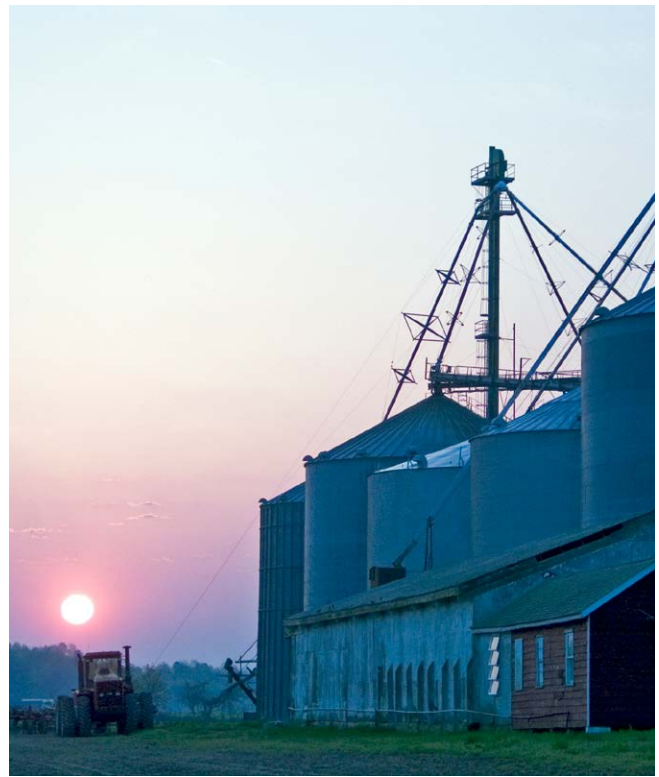
ABOVE: © ADRIAN JONES, INTEGRATION AND APPLICATION NETWORK, UNIVERSITY OF MARYLAND CENTER FOR ENVIRONMENTAL SCIENCE

One of the largest hurdles identified was the lack of focus on marginal and low-conflict land as the priority for development. Currently a regulated market drives renewable energy investments. This market often drives those investments to the cheapest and largest contiguous plots, which are often forested or used for agriculture. Discussions around reshaping how that market is regulated (incentives, siting criteria etc.) could shift the development to marginal, degraded or low-conflict areas. There were a broad range of other hurdles that fell into the categories of economic, financing, engineering and community resistance to projects. By evaluating each of these hurdles with a shared outcome of driving development to marginal or low conflict lands we can accelerate renewable deployment to maximize benefit and reduce negative impacts. Participants identified the critical role that state and local governments play in the process of removing hurdles. Although several hurdles were identified that fall outside of State and local jurisdictions, including, the reduction of federal tax credits, tariffs and international market costs of goods directly related to development.