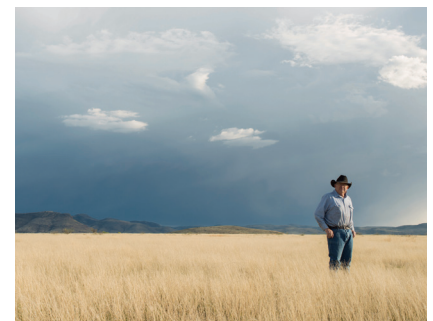
Ranchers have an enormous opportunity to address some of the greatest environmental challenges facing the world today: water, biodiversity and climate.

At scale, virtual fencing may unlock the use of practices that regenerate land health and help address climate change and biodiversity loss.