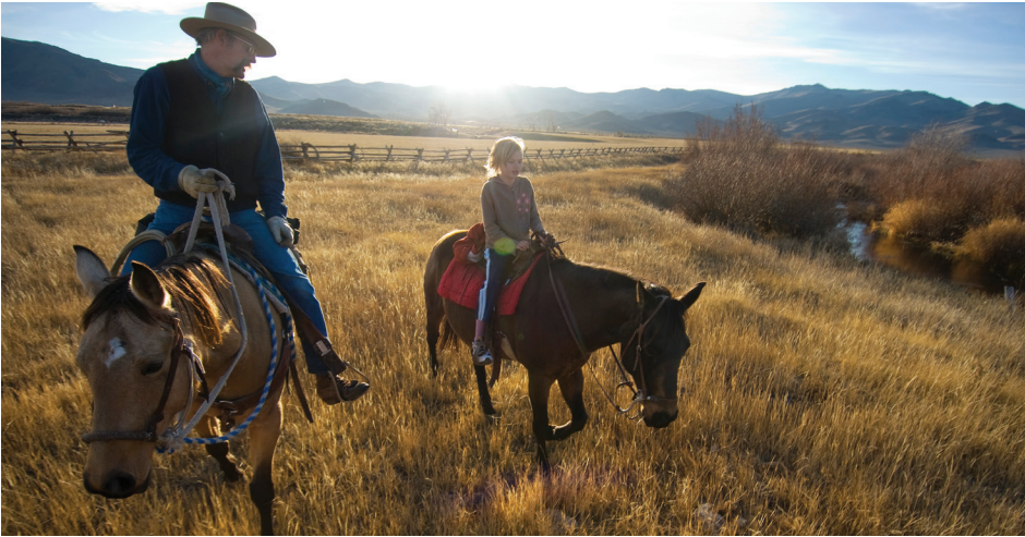
Ranchers are among our greatest allies in conservation. The owners of the Alderspring Ranch in Idaho manage their land with conservation practices that help to protect a stretch of the Pahsimero River that contains as much as 40 percent of the chinook spawning areas for the entire river.