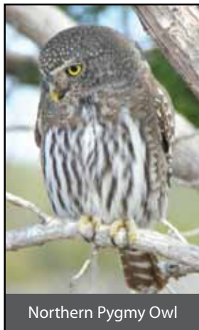
Northern Pygmy Owl

Woodpeckers including Hairy, Downy, Ladder-backed, Red-shafted Flicker, and Red-naped and Williamson's Sapsucker can be found year-round. In migration and in summer, you are likely to find warblers, flycatchers, as well as Black-headed Grosbeak, and hummingbirds. Arrive early to listen for Warbling, and Plumbeous Vireos, Hermit Thrush, Spotted Towhee, Western Tanager, and Bullock's Oriole. Olive-sided and Ash-throated Flycatchers, Black and Say's Phoebes, Cassin's and Western Kingbirds make use of the perches over the water and up the opposite slope, while Empidonax flycatchers may be seen in the bosque (riparian woods). Lazuli Bunting and House Wren are possible as well.