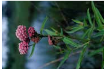
From top: American bittern, cardinal flower, leopard frog, red-winged blackbird, swamp milkweed