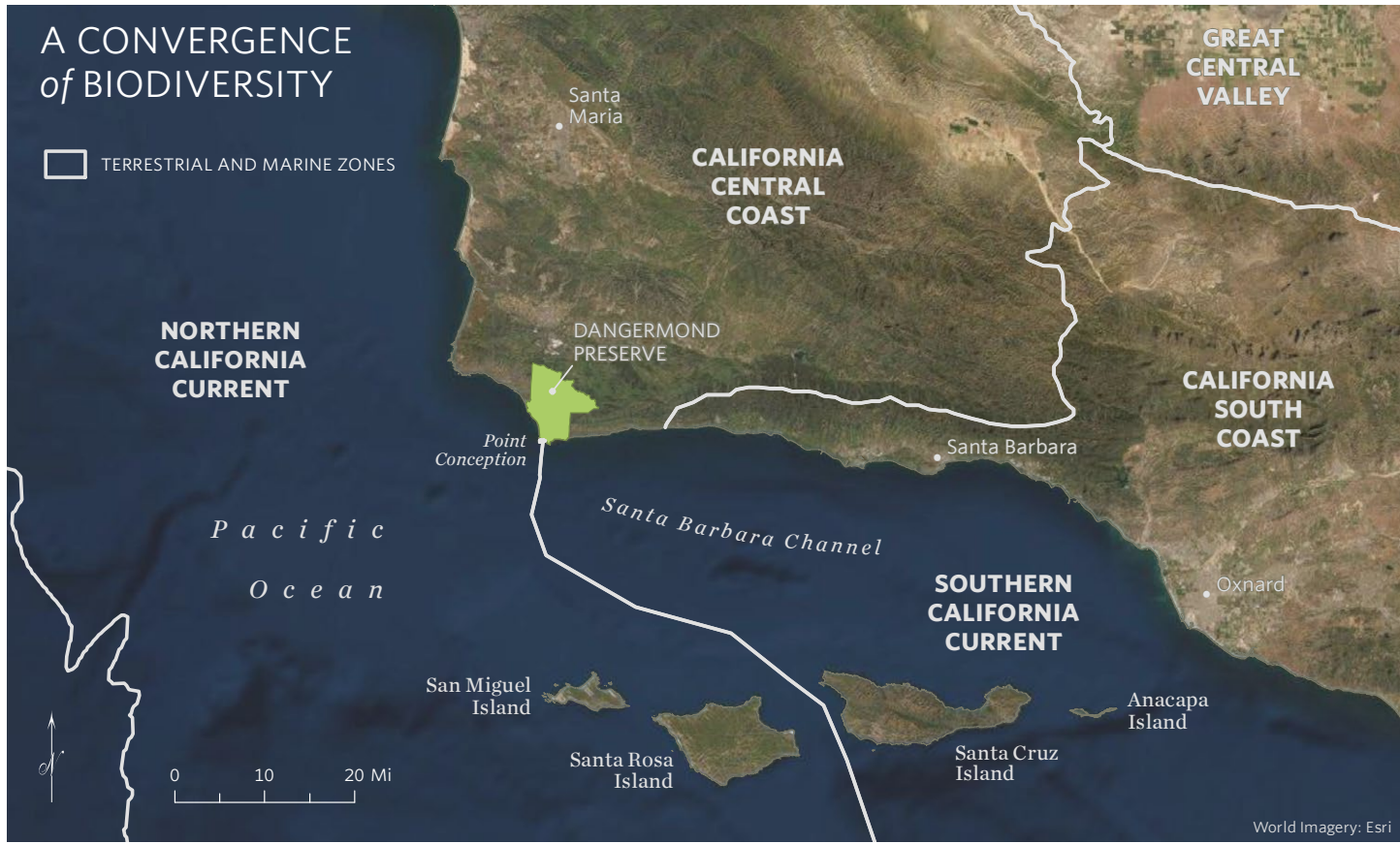
The Point Conception region sits at a major ecological intersection that is among the most biologically rich in the world and contains some of the highest concentrations of imperiled species in the country.