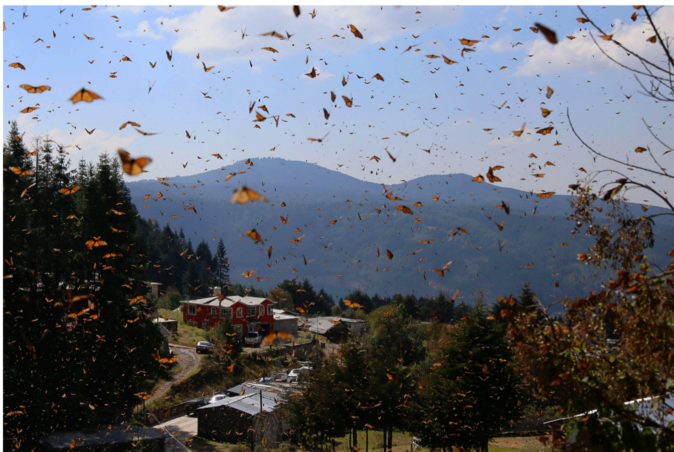
FLUTTER SPEED MEETS SHUTTER SPEED Monarch butterflies fill the air around the mountaintops in the Monarch Butterfly Biosphere Reserve, a UNESCO World Heritage Site in Michoacán, Mexico.

The migratory monarch butterfly, a subspecies of the monarch butterfly, was recently added to the IUCN's Red List as an endangered species, due to pressures from habitat loss and climate change.